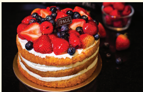
GÂTEAU MASCARPONE Y $62 / $168

Genoese sponge cake with mousseline cream and fresh strawberries, finished with pale green marzipan and decorated with more strawberries.