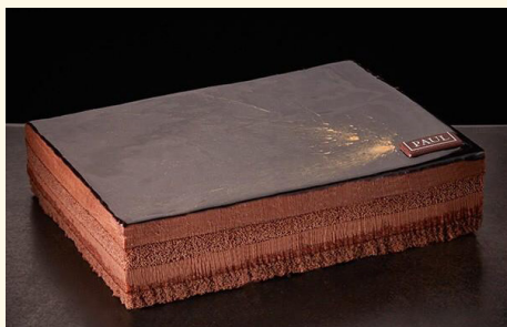
CRAQUANT W $59 / $148