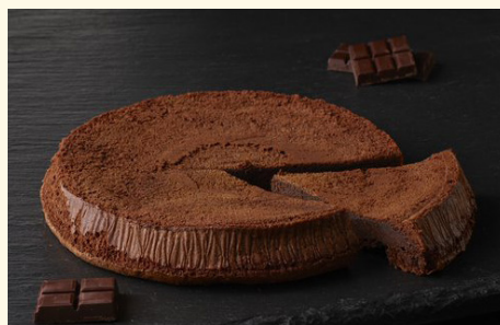
MOELLEUX CHOCOLATE V $58 Serves up to 8 slices