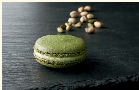
LE GRAND MACARON Q $7.90 (8cm / per pc)