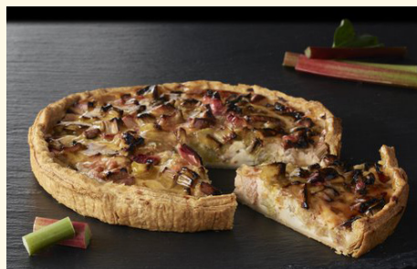
TARTE A LA RHUBARBE T $67 Serves up to 8 slices