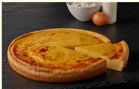
FLAN NATURE S $56 Serves up to 8 slices