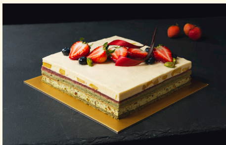
GÂTEAU TRIO AA $69

Dark chocolate mousse with flaky hazelnut biscuit and praline feuilletine.