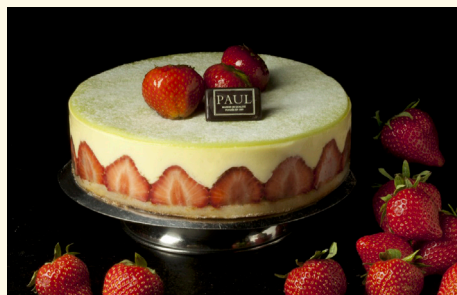
FRAISIER X $59 / $148

A dark chocolate sponge cake with chocolate mousse, a thin layer of crisp praline and a dark chocolate glaze.