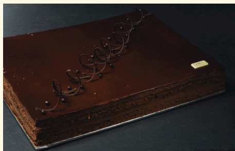
COCOA TRUFFLE BB $148

Pistachio joconde cake, fresh berries, strawberry jelly, mango bavaois, pistachio crunchy praline and pistachio chocolate mousse.