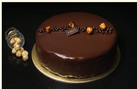
PALET D'OR Z $58

Vanilla sponge cake layered with mascarpone cream and topped with mixed berries.