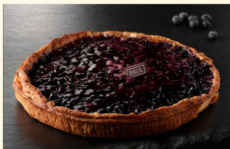
TARTE AUX MYRtilLES U $69 Serves up to 8 slices