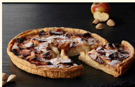
FLAN NORMAND R $63 Serves up to 8 slices